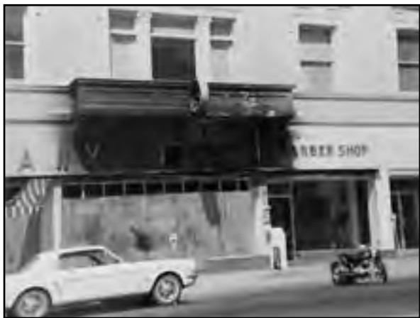
After the fire