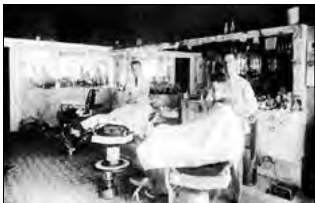
The Barber Shop in 1922