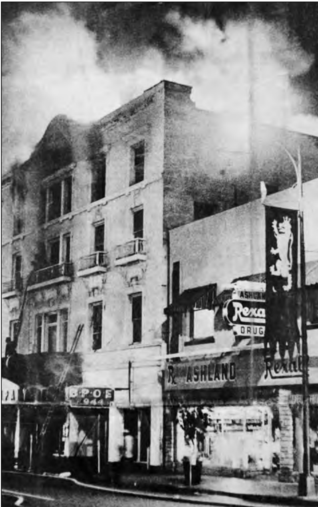
July 17, 1968 fire. Note fire fighters on central balconies.